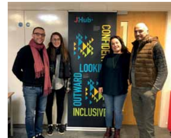
Volunteers at JHub following some training there in January 2019