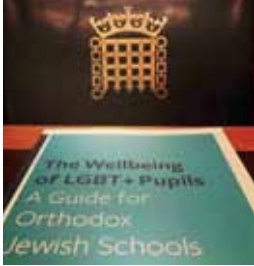
The Guide at our Chanukah event in Parliament 2018