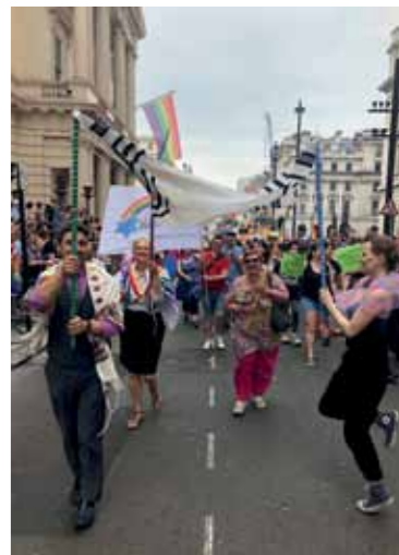
Members and leaders of West London Synagogue joining KeshetUK at Pride in London