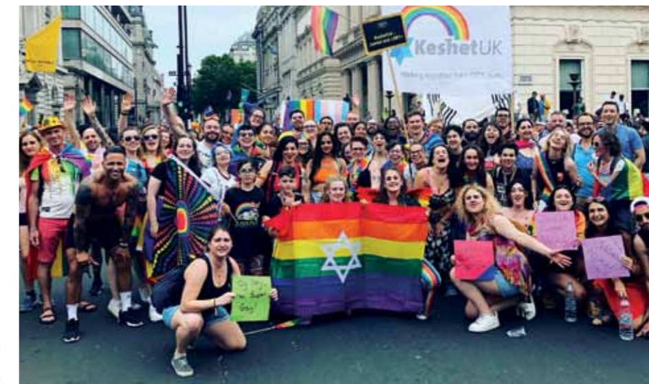
KeshetUK and Friends at Pride in London 2019