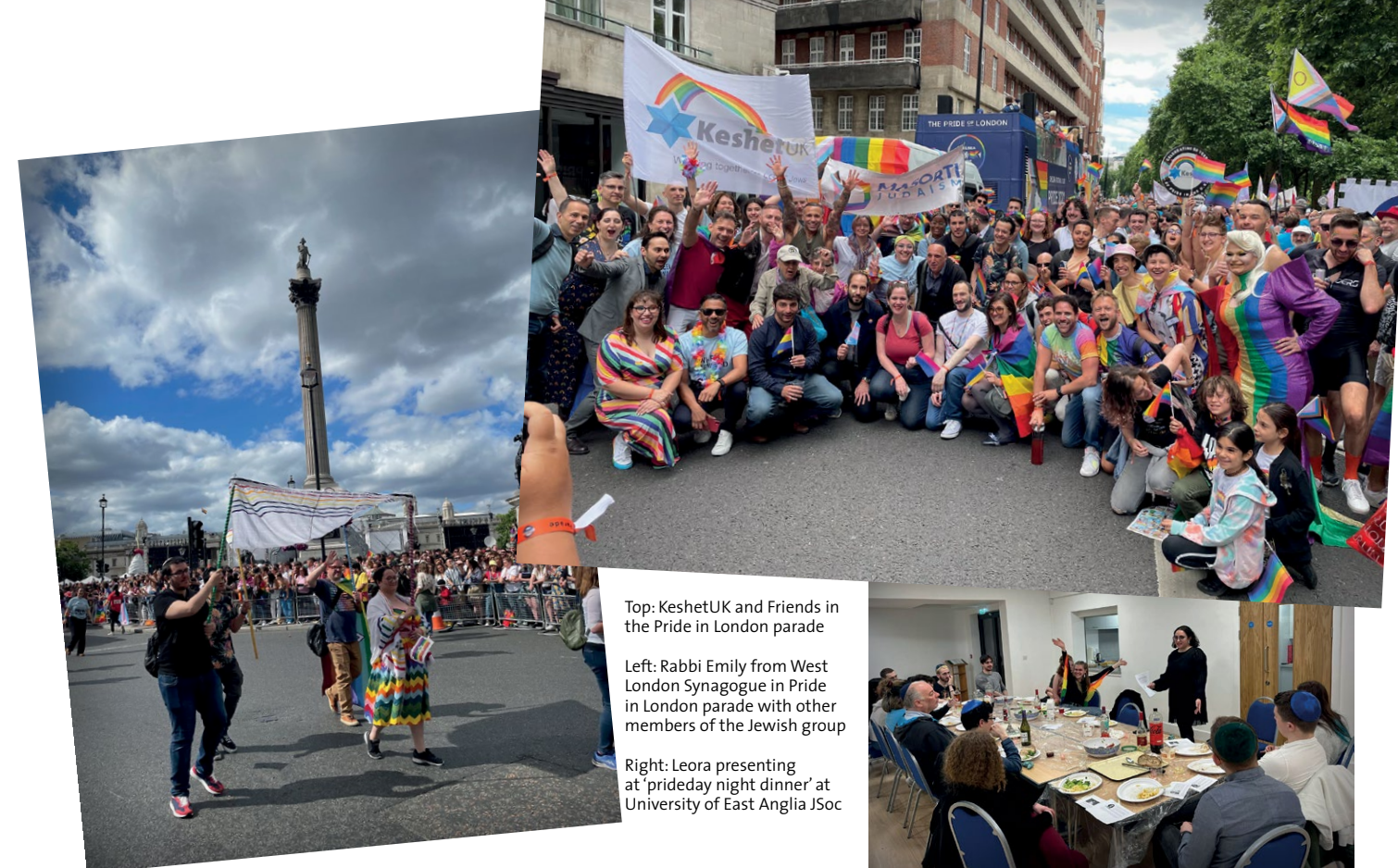
Top: KeshetUK and Friends in the Pride in London parade

If you would like to find out more about volunteering please go to: www.keshetuk.org/volunteer .