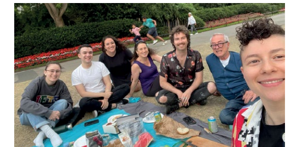
KeshetUK's first ever volunteer picnic