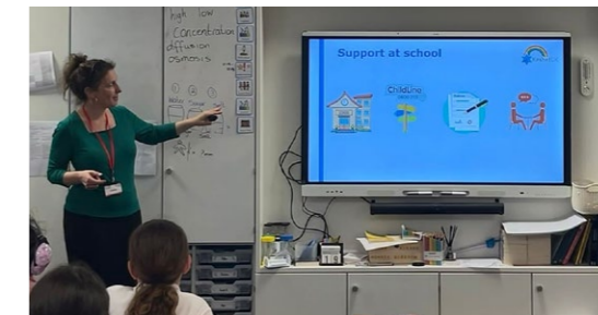
Yavneh Primary school pupil workshop

“Working with the team at KeshetUK was very smooth. They took the time to really listen to our unique context and work with us to shape trainings that would suit our needs and our different audiences. The result was lively conversation and a lot of food for thought.”