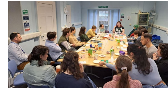
Session with Jewish students at the University of St Andrews Jewish Society