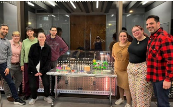
Volunteer Channukah social