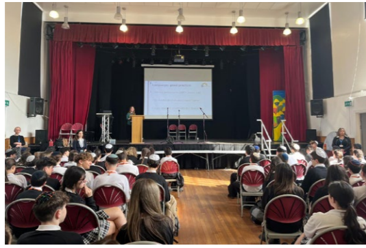
Year 9 assembly at Yavneh College

“It was a helpful and positive experience having KeshetUK deliver training. This training raised the knowledge and confidence of our members of staff.”