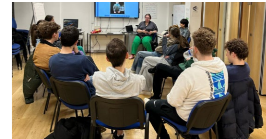
FZY hadrachah training

We are also pleased to be partnering with Belsize Square Synagogue as the first full ‘client’ for our Consultation Support Service. This involves an in-depth, rigorous and multi-month engagement looking at all aspects of the synagogue’s policies, activities and culture. We believe this is a very powerful model to make lasting change within institutions.