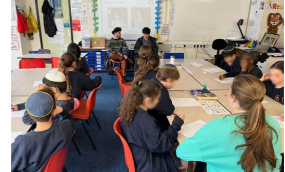
North Cheshire Jewish Primary School

Our workshops don't just build pupils' understanding of why acts of allyship are important. They also help to give pupils the practical skills and ideas for action that they need. This year, two-thirds have gained new ideas for small everyday acts of allyship, and three-quarters have learned skills to enable them to be an active bystander when they witness discrimination or harassment.